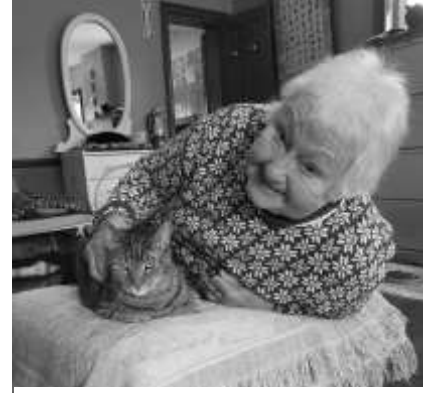
Bo at home with his new mom

After two weeks, our cat adoption team heard from Bo's mom. "It's been two weeks that Bo came into my heart and home, and he is just so wonderful," said his new mom. "I feel like a mother to him. He sleeps next to me when I take a nap on the couch. He sleeps in bed with me and curls up in my lap when I watch television at night. He is just so wonderful." Bo now has lots of toys, treats, and food - and he loves to eat fish! "I just wanted to tell you that this is the most wonderful matchup between Bo and me. It couldn't have been better. So you [Pets Alive cat adoption team] were right to target Bo and me to be together," said Bo's mon.