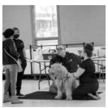
Providing vet care at Helping Hands Helping Paws event

Our community needs us, and we need you. Our community outreach programs are VITAL to help keep families together and pets out of at-capacity shelters. Our Pet Chow Pantry provides free dog and cat food, and our Helping Hands Helping Paws program brings affordable and accessible medical care. Our TNVR (Trap-Neuter-Vaccinate-Return) and trap loaner programs stop homeless kittens from being born. We are building intake diversion programs: a searchable database for pet-friendly housing, rehoming resources, and pet-friendly hotels. The animal shelter crisis is real; we must work harder to keep pets