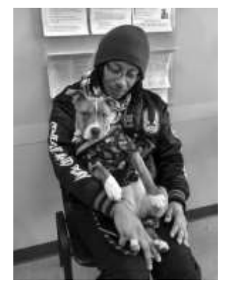
A dad & his dog at Helping Hands Helping Paws event

CHALLENGES . 2022 is one of the most challenging years we have experienced. The animal shelters in our country are in CRISIS! An estimated 100,000 more dogs and cats are in our country's shelter system than last year. Let that sink in—100,000 more homeless animals. Families are losing their homes, being forced out of their apartments, and unable to find affordable housing that accepts pets. Pet food prices are increasing, and families struggle to feed their pets. An estimated shortage of nearly 7,000 veterinarians in the United States makes it harder for families to access veterinarian care. A perfect storm is happening across the country, including here at Pets Alive. We are experiencing a massive spike in stray pets brought to us by our Animal Control Officers; owner surrenders are up, pleas for help with pet food and veterinarian care are up, and adoptions are way down.