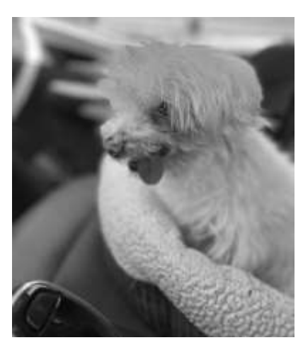
Keeper hangs out with his new family

Shortly after he was adopted, Keeper's eye burst and he had it removed. He was no longer in pain and quickly learned how to navigate his home with only one eye. Recently he was diagnosed with