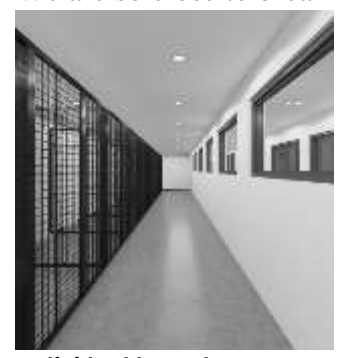
Individual kennels area

We are so close to breaking ground on our new state-of-the-art facility; we can